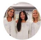
Girls in STEM